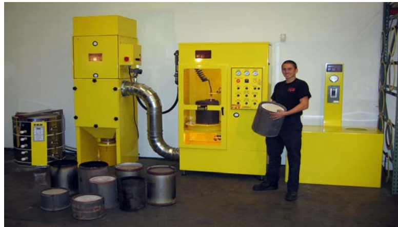
TrapBurner 7 SootSucker 2 TrapBlaster 7 TrapTester 7 Stage 2 cleaner Dust Collector Pneumatic Cleaner DPF TestBench

Stage 2: Thermal cleaning at 1112 degrees is done on site at O'Halloran International. The optional thermal process takes 12 hours to complete.